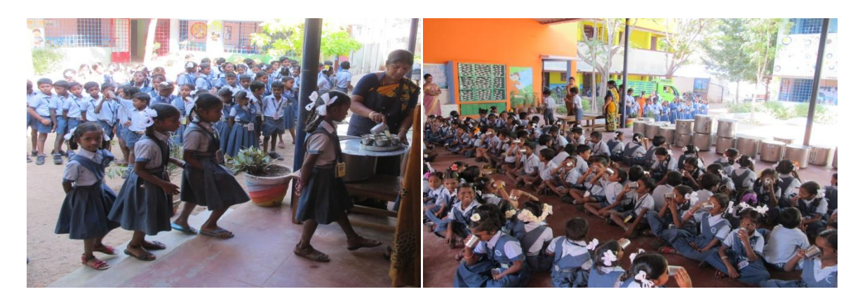
HAND WASH & NOON MEAL TAKEN BY CHILDREN IN SCHOOL